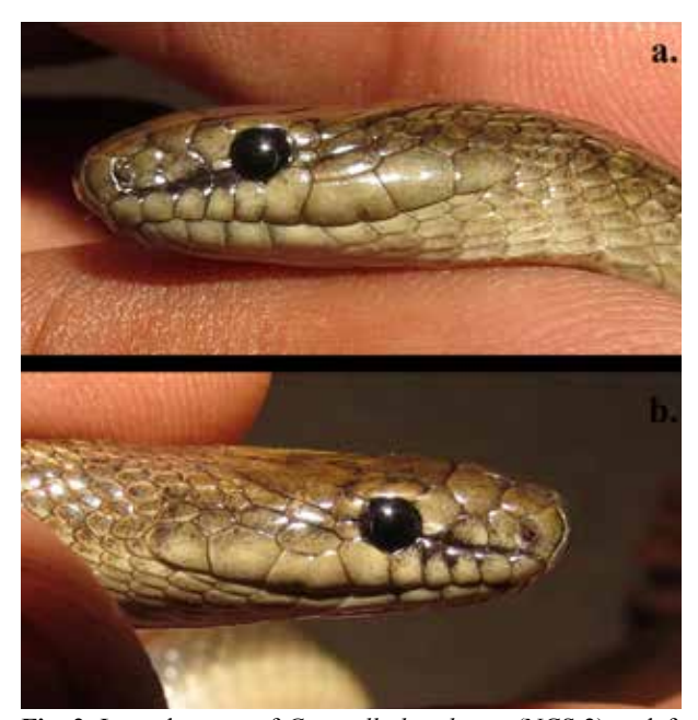
Fig. 2. Lateral aspect of Coronella brachyura (NCS 2); a, left side showing 8 supralabials and 5<sup>th</sup> supralabial partly divided; b, right side showing 9 supralabials, 4–6<sup>th</sup> touching eye.

labials, the 4<sup>th</sup> and 5<sup>th</sup>, sometimes 5<sup>th</sup> and 6<sup>th</sup> and rarely 4<sup>th</sup> to 6<sup>th</sup> (4<sup>th</sup> and 5<sup>th</sup> fide . Smith 1943) touch the eye (Fig. 2); 9–11 infralabials.