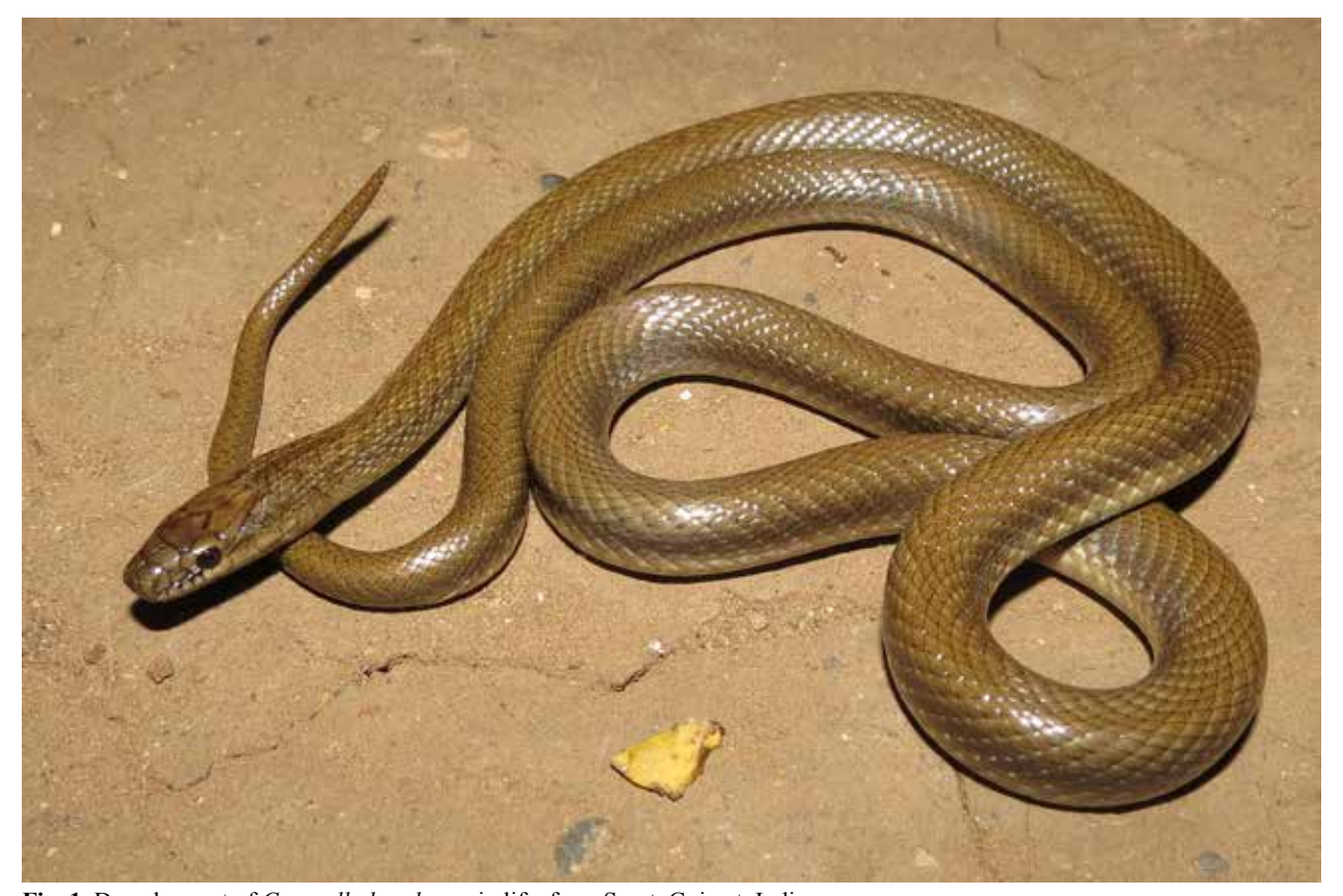
Fig. 1. Dorsal aspect of Coronella brachyura in life, from Surat, Gujarat, India.

Lepidosis: Dorsal scale rows (DSR) smooth, in most specimens 23:23:19 (23:23:21 in BNHS 3407; 23:23:17 in NCS 2); with single apical pit on the posterior margin. Ventrals 209–237 (maximum 224 fide. Smith 1943); anal undivided; subcaudals 43–54 (46–53 fide. Smith 1943); rostral wider than high, scarcely visible from above; 2 internasals, wider than long; 2 prefrontals, as long as wide, longer than the internasals; frontal bell shaped, slightly longer than wide; parietals longer than wide, slightly longer than frontal; 1 loreal, as long as high, rarely longer than high; 1 preocular reaching top of head; 2 postoculars; 2 anterior temporal scales; 2, rarely 1 posterior temporal scale(s); 8, sometimes 9 (8 fide. Smith 1943) supra-